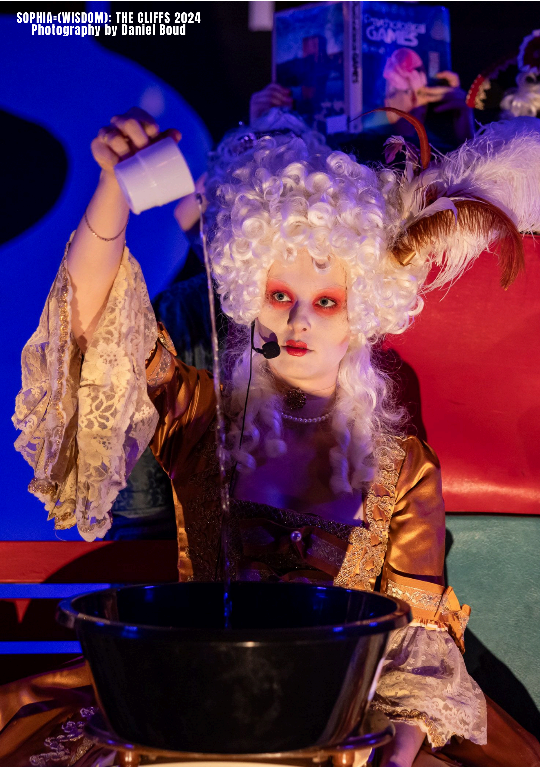
SOPHIA-(WISDOM): THE CLIFFS 2024