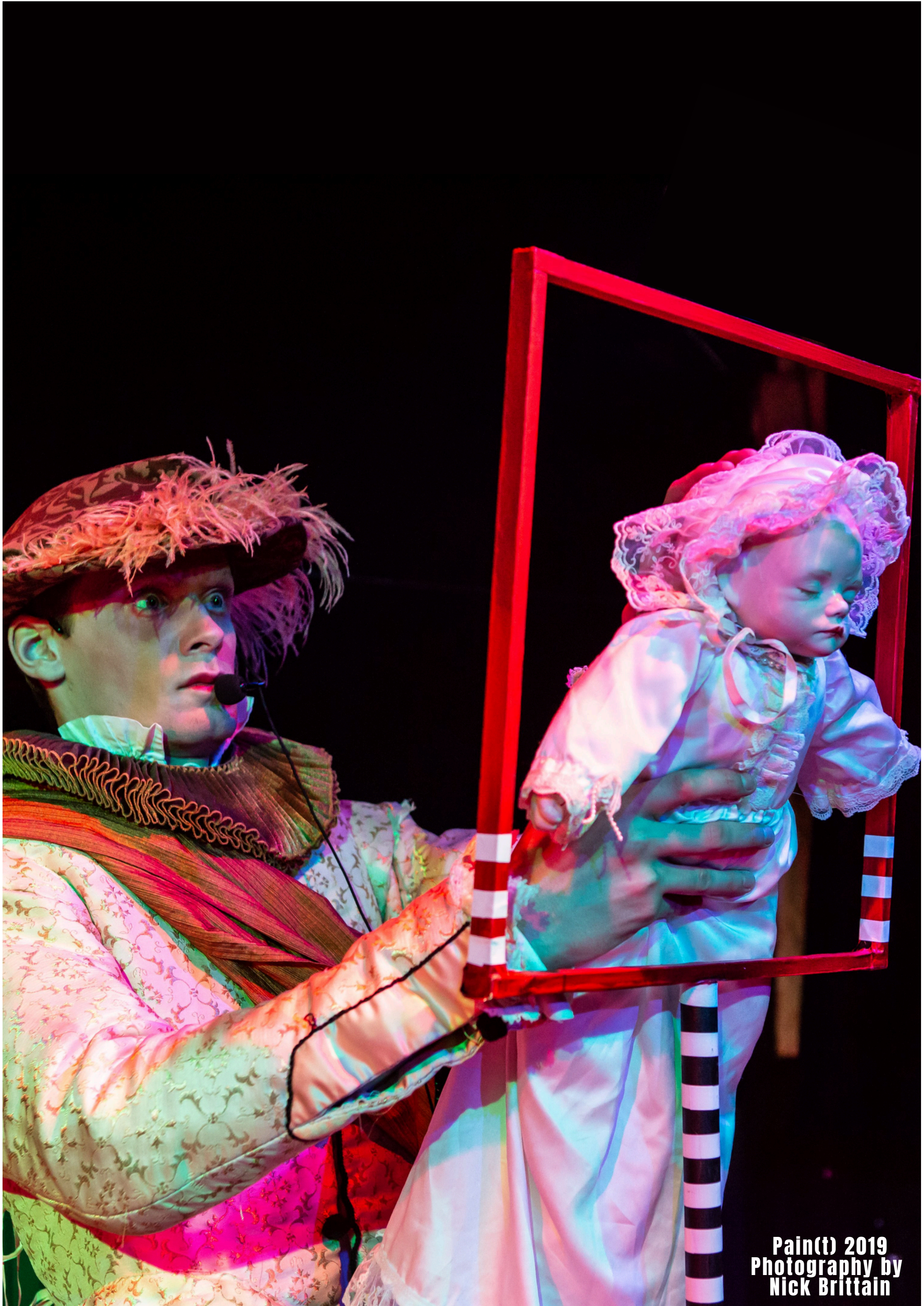
Pain(t) 2019