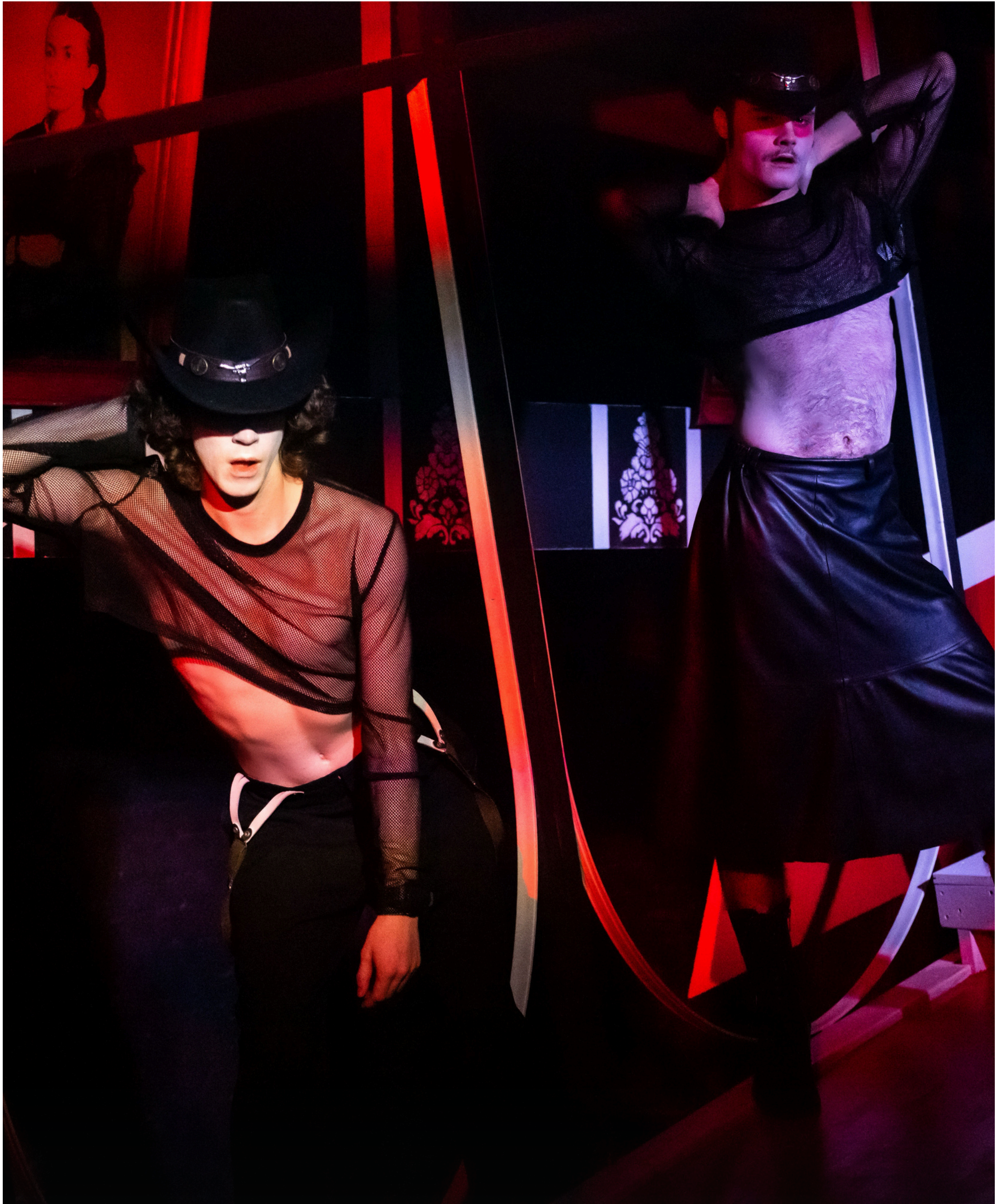
The Flea 2025